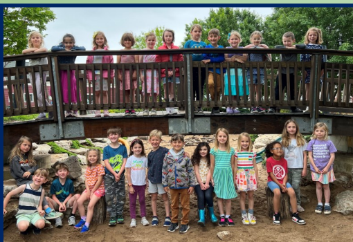
Early Childhood Bridgers