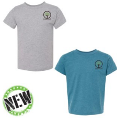
NEW Undercroft Montessori Tulsa - Toddler/Youth/Adult Blended SS T from $20.00

The Undercroft School Spirit Store is back! Check out our new merchandise, including redesigned T-shirts, hoodies, sweatshirts, and fleece pullovers. Ordering is now easy and online! A portion of the proceeds of sales goes back to support our school. You can order online here: https://theschooleys.com/collections/ucmtulsa .