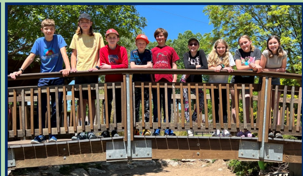
Upper Elementary Bridgers