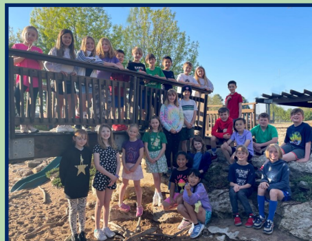
Lower Elementary Bridgers