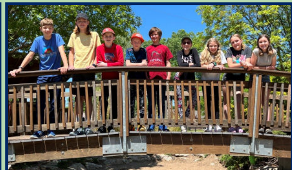
Upper Elementary Bridgers