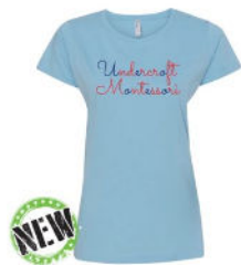
Undercroft Montessori Tulsa - "Script UCM" Ladies' Fine Jersey SS T from $20.00