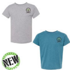
Undercroft Montessori Tulsa - Toddler/Youth/Adult Blended SS T from $20.00

The Undercroft School Spirit Store is back! Check out our new merchandise, including redesigned T-shirts, hoodies, sweatshirts, and fleece pullovers. Ordering is now easy and online! A portion of the proceeds of sales goes back to support our school. You can order online here: https://theschooleys.com/collections/ucmtulsa .