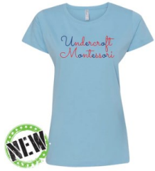
NEW Undercroft Montessori Tulsa - "Script UCM" Ladies' Fine Jersey SS T from $20.00